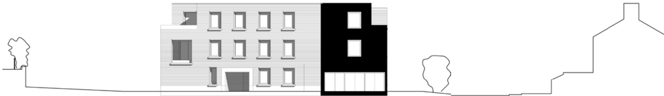
Section 3 1 : 100