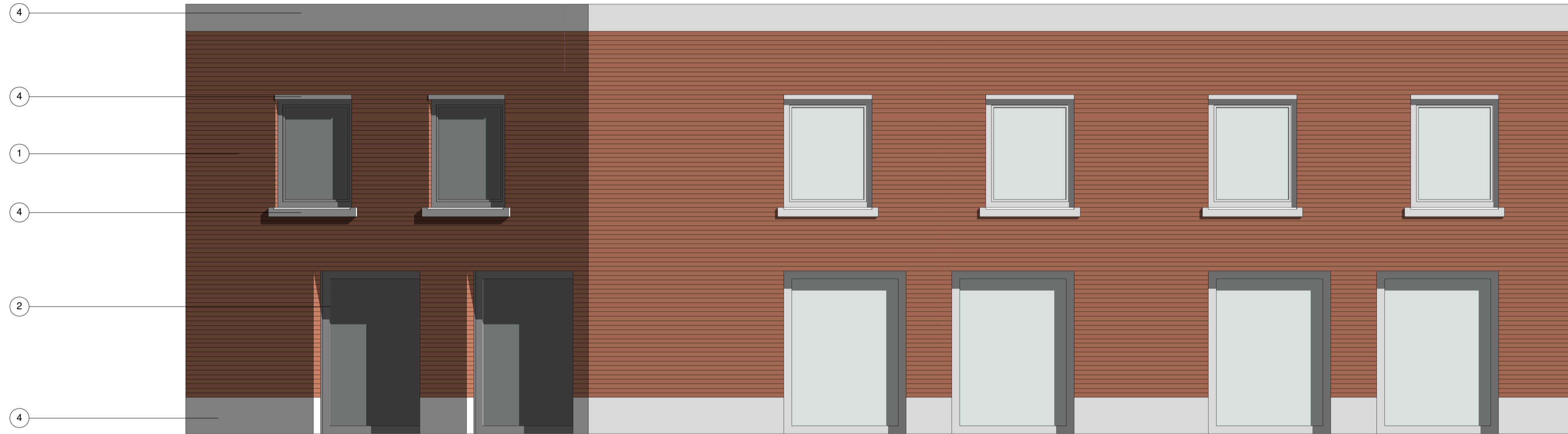
Terrace 2 - Garden Elevation 1 : 50

Note: Refer to Landscape Architects drawings for information on hard and soft landscaped areas surrounding proposed residential buildings