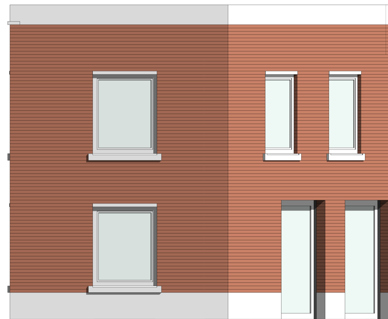
Terrace 2 - South Elevation 1 : 50