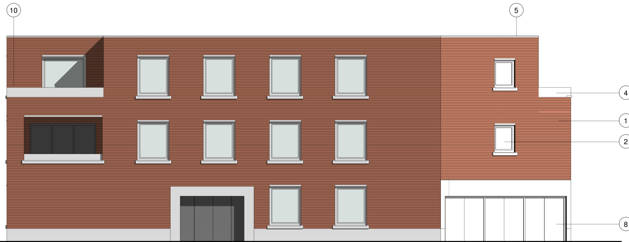
Block B - Elevation C