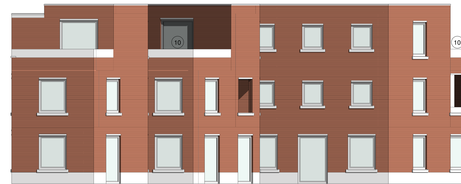
Block B - Elevation D