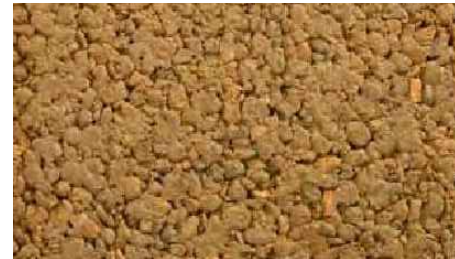
Buff Coloured Hot Rolled Asphalt 10mm aggregate size