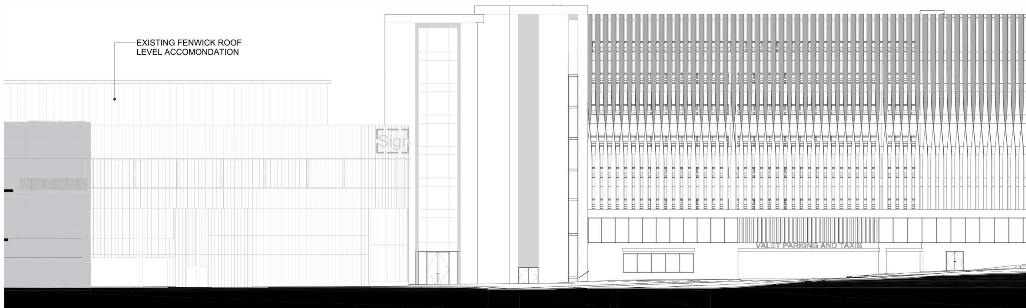
2 SOUTH ELEVATION 1 : 250