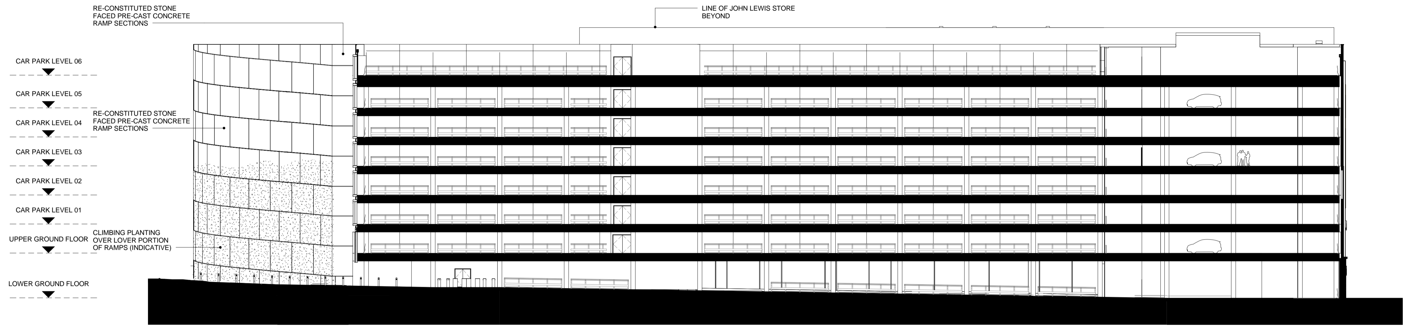
1 GA Long Section - A-A 1 : 250