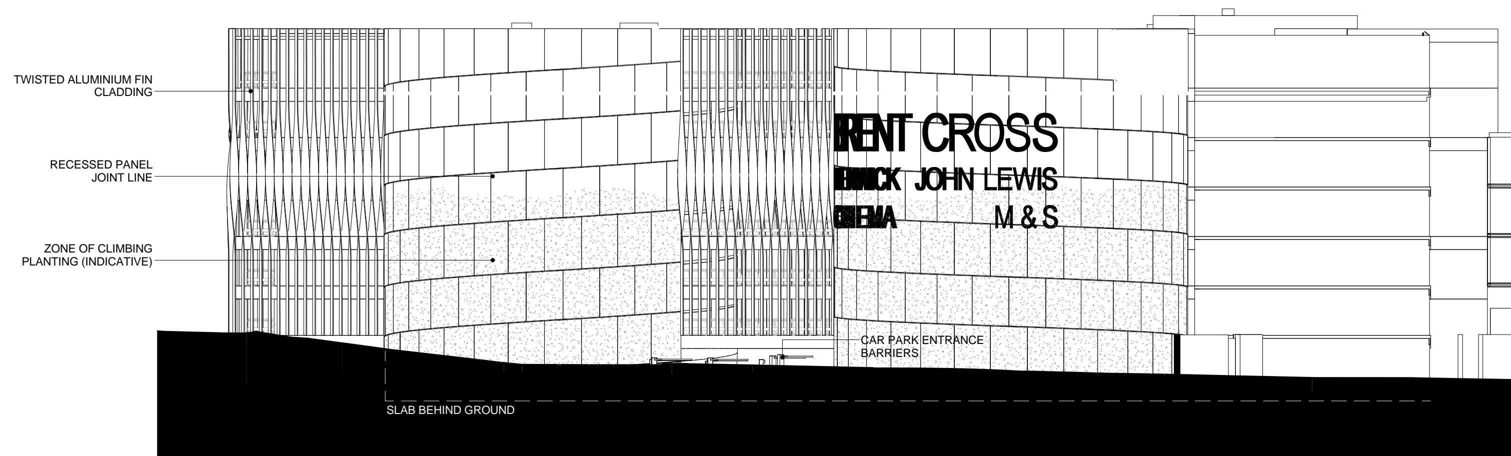
1 NORTH ELEVATION 1 : 250