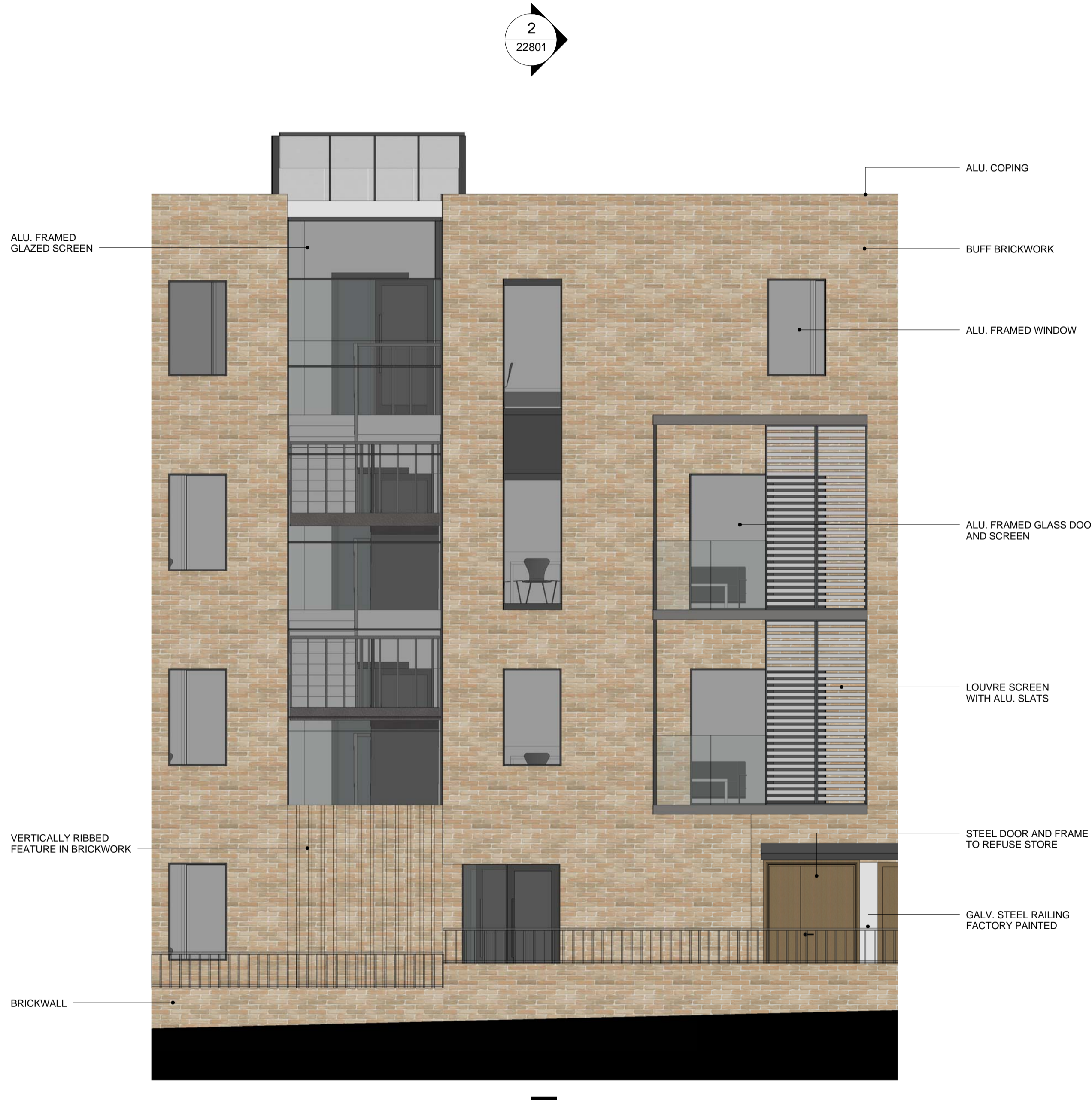
1 EAST FACADE BAY ELEVATION 1 : 50