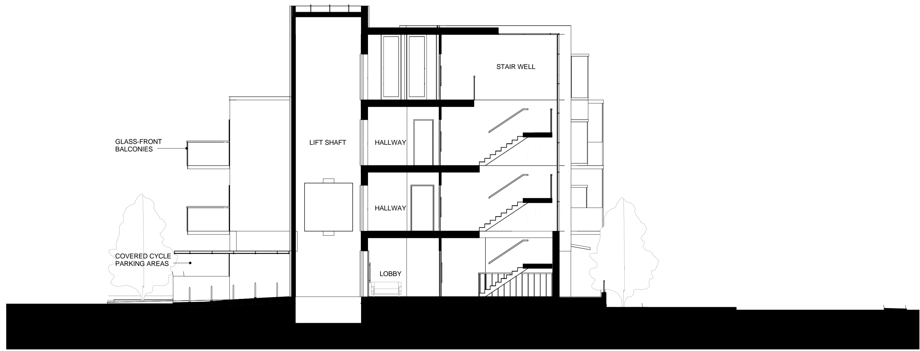
2 Cross-Section 2-2 (Cut Through Block 3) 1 : 100