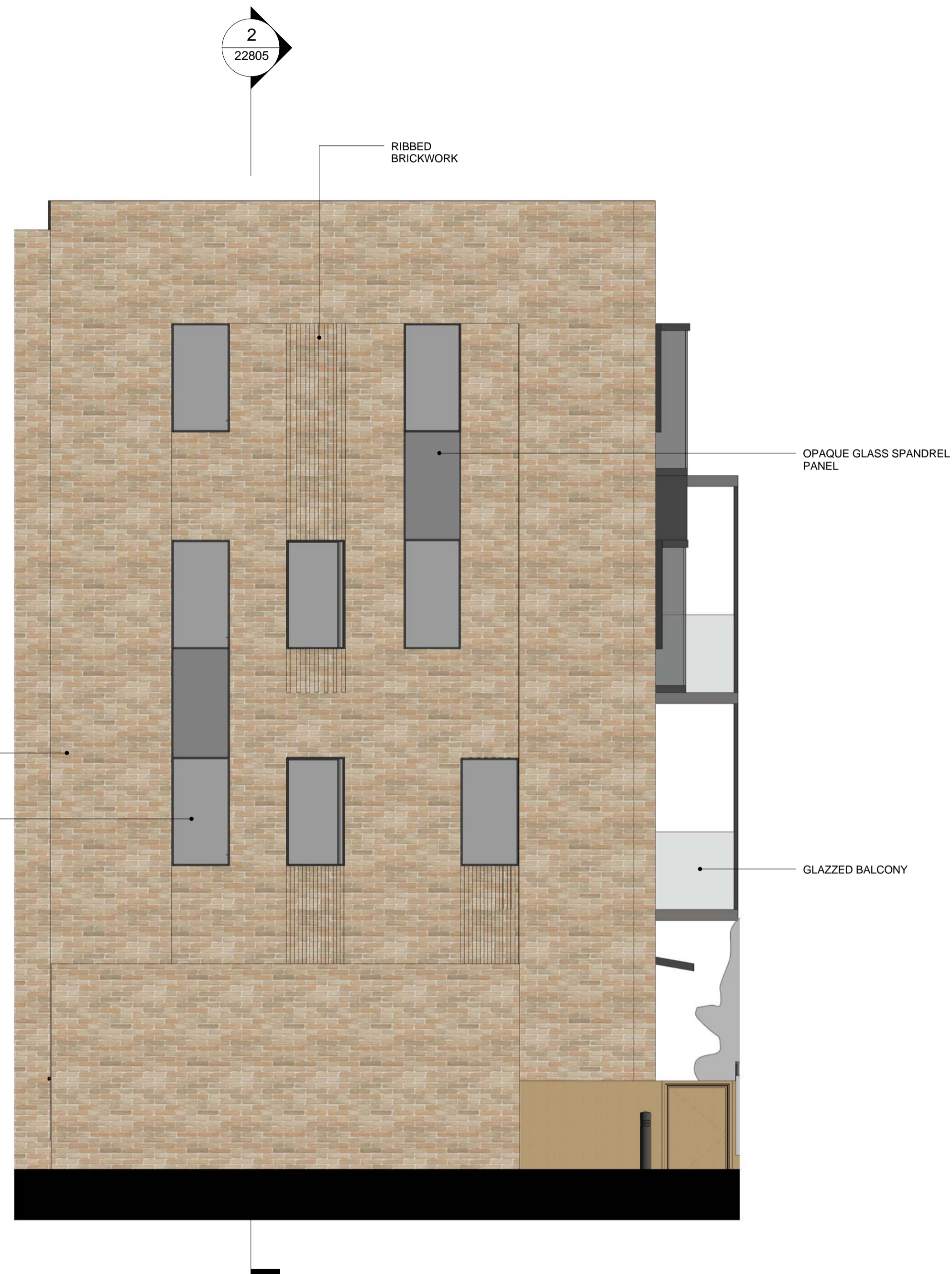
1 SOUTH FACADE BAY ELEVATION 1 : 50