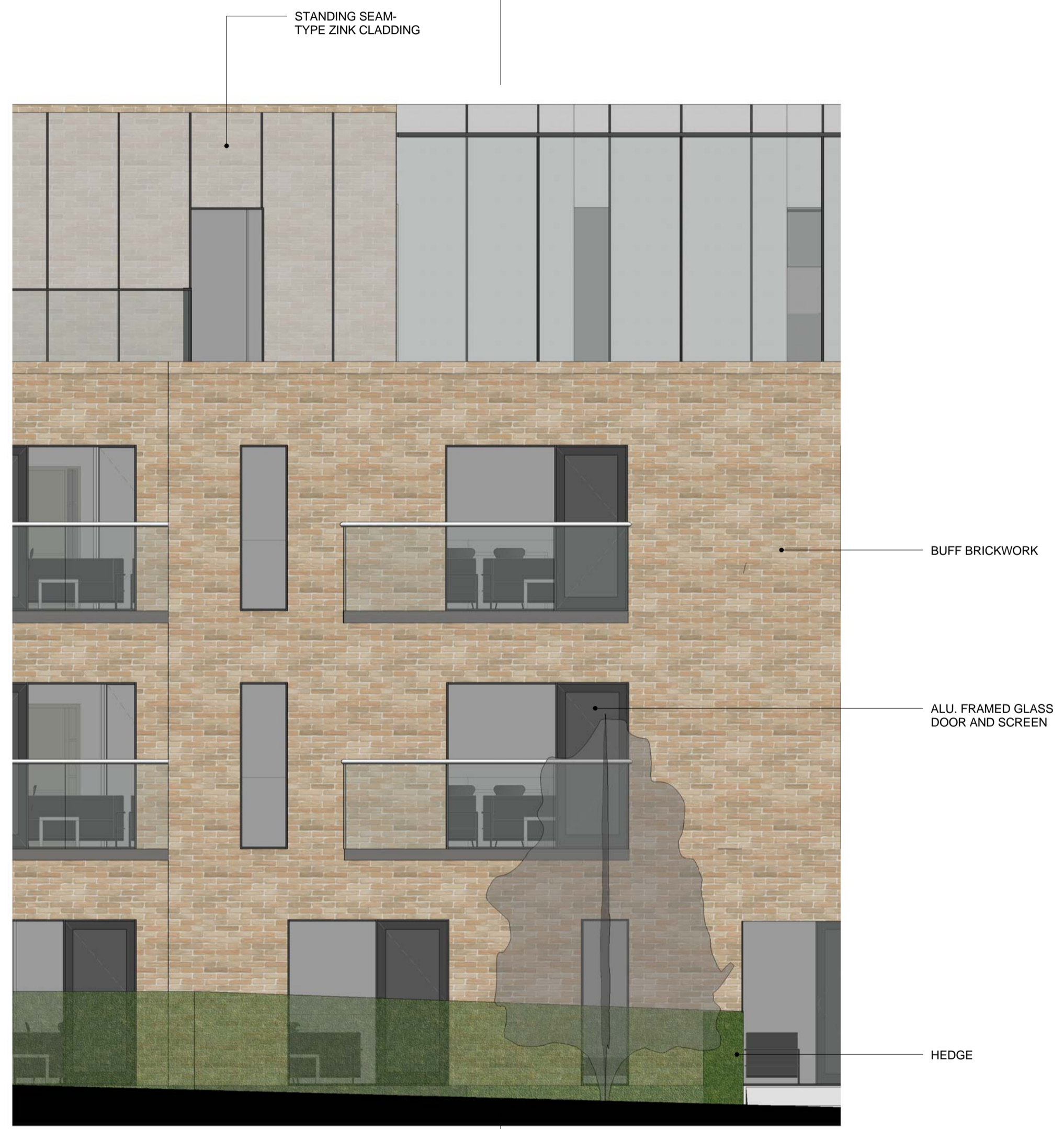
1 WEST FACADE BAY ELEVATION 1 : 50