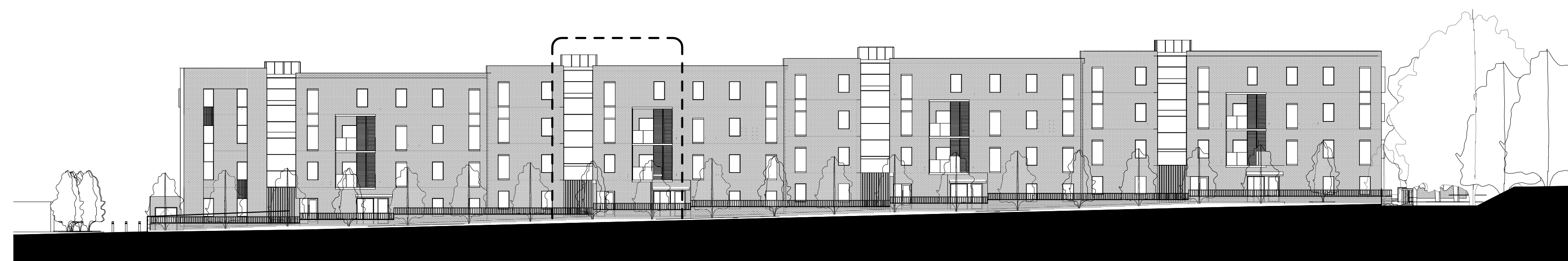
2 East Elevation 1 : 250