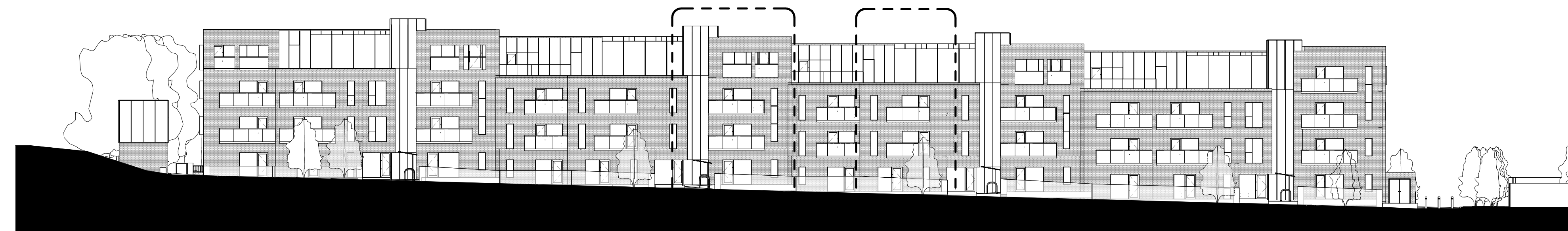
1 West Elevation 1 : 250