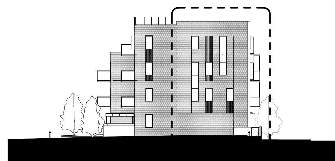
4 South Elevation 1 : 250