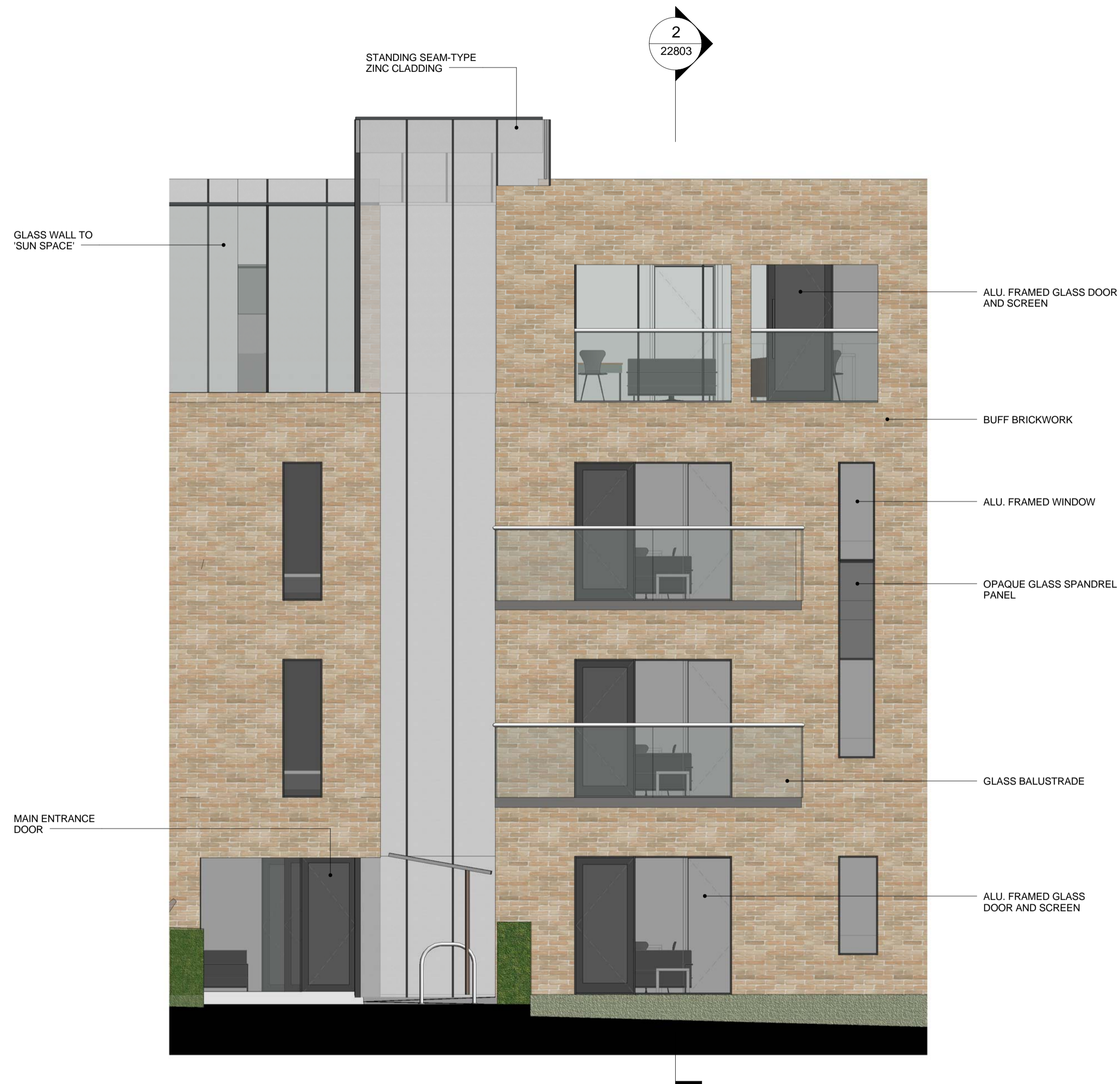
1 WEST FACADE BAY ELEVATION 1 : 50