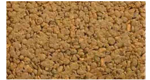
Buff Coloured Hot Rolled Asphalt 10mm aggregate size